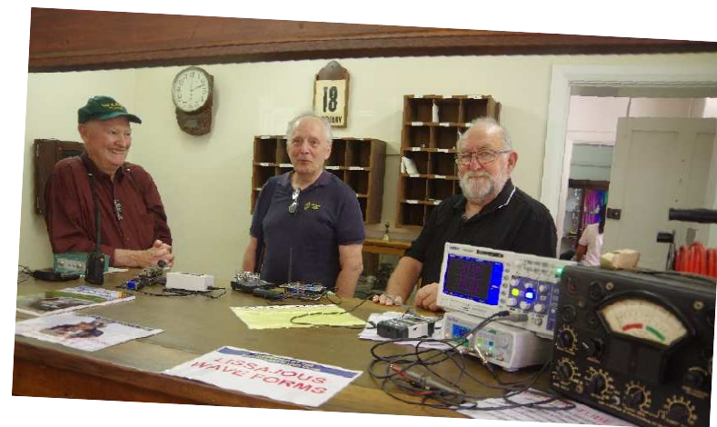
The North East Radio Club joined us.

City of TTG Community Grant: $3,800 – young visitors' booklet